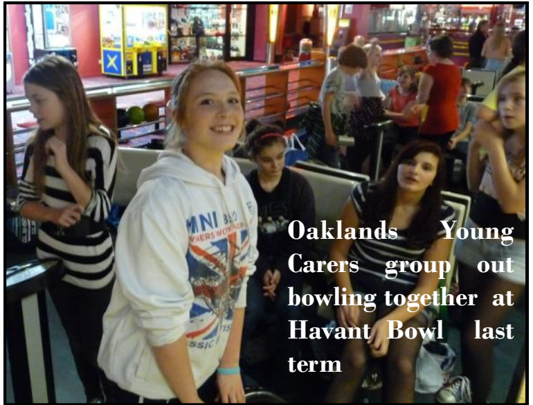
Oaklands Young Carers group out bowling together at Havant Bowl last term

Just over a year ago three members of staff and four students came together during a lunchtime for the very first meeting of the Oaklands Young Carers Group. Ever since that first meeting the group has been growing and currently 31 students regularly attend each week while seven members of teaching and support staff give up their free time to help with the group. Young Carers, children under the age of 18 who provide extra care for parents, siblings and other relatives due to illness, disability or addiction, is a hot topic at the moment, and Oaklands is ensuring that young carers in our community are getting the support they so keenly need and deserve.